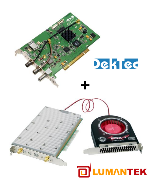
High-Quality Versatile RF Signal Generator

The latest pricing information and a list of DekTec resellers can be found on www.dektec.com.