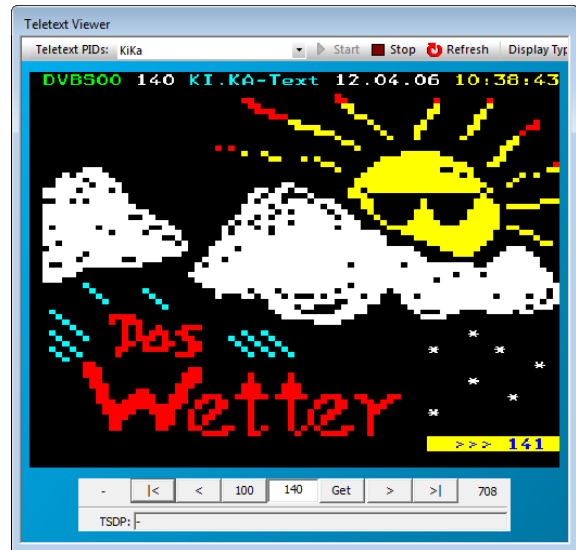
Teletext decoding and analysis