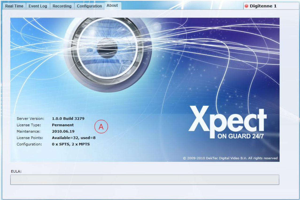
A: Version and licence status information for Xpect.

The About tab shows the licence, version and copyright information for Xpect, as well as the EULA.